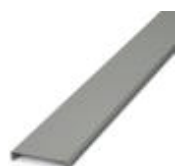
Cover for cable duct, gray, width: 25 mm, length: 2000 mm