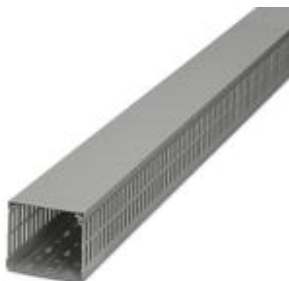
Wiring channel, gray, consisting of upper and lower part, width: 25 mm, height: 40 mm, length 2000 mm

Please be informed that the data shown in this PDF Document is generated from our Online Catalog. Please find the complete data in the user's documentation. Our General Terms of Use for Downloads are valid ( http://phoenixcontact.com/download )