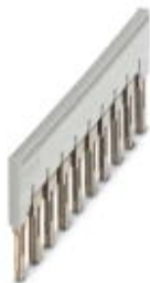
Plug-in bridge, pitch: 8.2 mm, width: 80.3 mm, number of positions: 10, color: gray

Please be informed that the data shown in this PDF Document is generated from our Online Catalog. Please find the complete data in the user's documentation. Our General Terms of Use for Downloads are valid ( http://phoenixcontact.com/download )