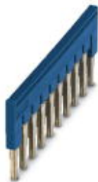
Plug-in bridge, pitch: 6.2 mm, width: 60.3 mm, number of positions: 10, color: blue

Please be informed that the data shown in this PDF Document is generated from our Online Catalog. Please find the complete data in the user's documentation. Our General Terms of Use for Downloads are valid ( http://phoenixcontact.com/download )