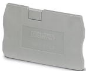
End cover, length: 48.6 mm, width: 2.2 mm, height: 29.1 mm, color: gray

Please be informed that the data shown in this PDF Document is generated from our Online Catalog. Please find the complete data in the user's documentation. Our General Terms of Use for Downloads are valid ( http://phoenixcontact.com/download )