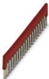
Plug-in bridge, pitch: 6.2 mm, width: 122.3 mm, number of positions: 20, color: red

Please be informed that the data shown in this PDF Document is generated from our Online Catalog. Please find the complete data in the user's documentation. Our General Terms of Use for Downloads are valid ( http://phoenixcontact.com/download )