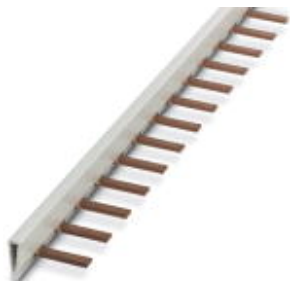
Insertion bridge, pitch: 18 mm, number of positions: 56, color: gray

Please be informed that the data shown in this PDF Document is generated from our Online Catalog. Please find the complete data in the user's documentation. Our General Terms of Use for Downloads are valid ( http://phoenixcontact.com/download )