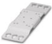
Universal wall adapter for securely mounting the power supply in the event of strong vibrations. The power supply is screwed directly onto the mounting surface. The universal wall adapter is attached at the top/bottom.

Assembly adapters - UWA 182/52 - 2938235