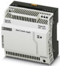
DIN rail power supply unit 24 V DC/3.5 A, primary switched-mode, 1-phase.

Please be informed that the data shown in this PDF Document is generated from our Online Catalog. Please find the complete data in the user's documentation. Our General Terms of Use for Downloads are valid ( http://phoenixcontact.com/download )