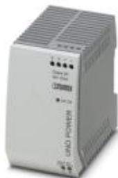
Primary-switched UNO POWER power supply for DIN rail mounting, input: 1-phase, output: 48 V DC/100 W

Please be informed that the data shown in this PDF Document is generated from our Online Catalog. Please find the complete data in the user's documentation. Our General Terms of Use for Downloads are valid ( http://phoenixcontact.com/download )