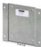
Mounting plate for SFNT switches

Mounting plate - FL PA SFNT 5-8 - 2891012