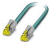
Patch cable, CAT6 A , 4-pair, shielded, connection not crossed (line), assembled at both ends with RJ45/IP20 connectors, outer sheath material: PUR, length: 2.0 m

Patch cable - NBC-R4AC/10G-R4AC/10G-94F/2,0 - 1408360