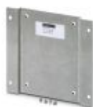
Mounting plate for SFNT switches

Mounting plate - FL PA SFNT 5-8 - 2891012