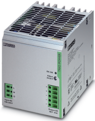
Primary-switched TRIO POWER power supply for DIN rail mounting, input: 1-phase, output: 48 V DC/10 A

Please be informed that the data shown in this PDF Document is generated from our Online Catalog. Please find the complete data in the user's documentation. Our General Terms of Use for Downloads are valid ( http://phoenixcontact.com/download )