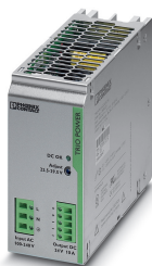
Primary-switched TRIO POWER power supply for DIN rail mounting, input: 1-phase, output: 24 V DC/10 A

Please be informed that the data shown in this PDF Document is generated from our Online Catalog. Please find the complete data in the user's documentation. Our General Terms of Use for Downloads are valid ( http://phoenixcontact.com/download )