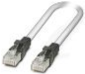
Patch cable, CAT5, assembled, 0.5 m

Patch cable - FL CAT5 PATCH 0,5 - 2832263