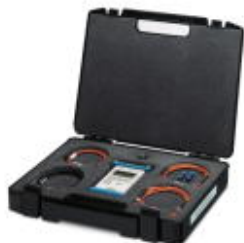
Fiber optic measuring case, consisting of an optical power meter, F-SMA, B-FOC adapters, reference fibers and operating instructions

Please be informed that the data shown in this PDF Document is generated from our Online Catalog. Please find the complete data in the user's documentation. Our General Terms of Use for Downloads are valid ( http://phoenixcontact.com/download )