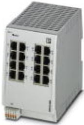
Managed Switch 2000, 16 RJ45 ports 10/100 Mbps, degree of protection: IP20, PROFINET Conformance-Class A

Please be informed that the data shown in this PDF Document is generated from our Online Catalog. Please find the complete data in the user's documentation. Our General Terms of Use for Downloads are valid ( http://phoenixcontact.com/download )