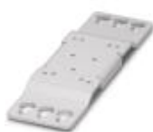
Universal wall adapter for securely mounting the power supply in the event of strong vibrations. The power supply is screwed directly onto the mounting surface. The universal wall adapter is attached at the top/bottom.

Assembly adapters - UWA 182/52 - 2938235