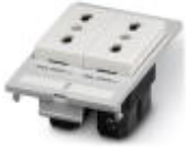
Ground contact socket, plastic, for Italy