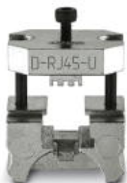
Die, for unshielded RJ45 plugs, universal

Please be informed that the data shown in this PDF Document is generated from our Online Catalog. Please find the complete data in the user's documentation. Our General Terms of Use for Downloads are valid ( http://phoenixcontact.com/download )