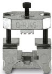
Die, for unshielded RJ45 plugs

Please be informed that the data shown in this PDF Document is generated from our Online Catalog. Please find the complete data in the user's documentation. Our General Terms of Use for Downloads are valid ( http://phoenixcontact.com/download )