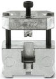
Die, for unshielded RJ-22 plugs

Please be informed that the data shown in this PDF Document is generated from our Online Catalog. Please find the complete data in the user's documentation. Our General Terms of Use for Downloads are valid ( http://phoenixcontact.com/download )