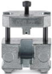
Die, for unshielded RJ11 plugs

Please be informed that the data shown in this PDF Document is generated from our Online Catalog. Please find the complete data in the user's documentation. Our General Terms of Use for Downloads are valid ( http://phoenixcontact.com/download )