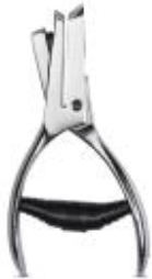
Punch pliers, for inspection tags and similar with 2 mm round mandrel, 30 mm mouth depth

Please be informed that the data shown in this PDF Document is generated from our Online Catalog. Please find the complete data in the user's documentation. Our General Terms of Use for Downloads are valid ( http://phoenixcontact.com/download )