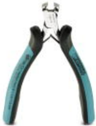
Electronic front cutter, without chamfer, with opening spring

Please be informed that the data shown in this PDF Document is generated from our Online Catalog. Please find the complete data in the user's documentation. Our General Terms of Use for Downloads are valid ( http://phoenixcontact.com/download )