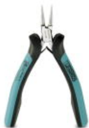
Electronic round-nose pliers, smooth grip, with opening spring

Please be informed that the data shown in this PDF Document is generated from our Online Catalog. Please find the complete data in the user's documentation. Our General Terms of Use for Downloads are valid ( http://phoenixcontact.com/download )