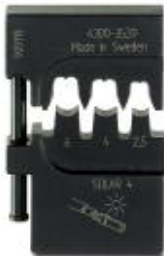
Die, for MC4 solar connectors, lateral entry, 2.5 - 6 mm 2

Please be informed that the data shown in this PDF Document is generated from our Online Catalog. Please find the complete data in the user's documentation. Our General Terms of Use for Downloads are valid ( http://phoenixcontact.com/download )