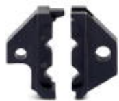
Spare die for CRIMPFOX-TC 10

Replacement die - CRIMPFOX-TC 10/DIE - 1212296