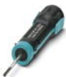
Assembly tool, for CK 1.6... crimp contacts for small conductor cross sections

Assembly tool - UNIFOX MT-CK 1.6/2.5 - 1089092