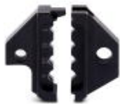
Spare die for CRIMPFOX-TC 4

Replacement die - CRIMPFOX-TC 4/DIE - 1212295