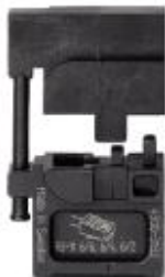
Die, for Crimpfox-M, for unshielded RJ11 connectors, packed in a serial storage box

Please be informed that the data shown in this PDF Document is generated from our Online Catalog. Please find the complete data in the user's documentation. Our General Terms of Use for Downloads are valid ( http://phoenixcontact.com/download )