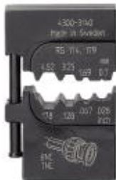
Die, for Crimpfox-M, for coaxial connectors (BNC/TNC) RG 58/ 59/ 62/ 71, packed in a serial storage box

Please be informed that the data shown in this PDF Document is generated from our Online Catalog. Please find the complete data in the user's documentation. Our General Terms of Use for Downloads are valid ( http://phoenixcontact.com/download )