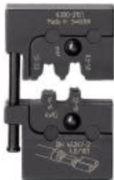
Die, for Crimpfox-M, for non-insulated slip-on sleeves 0.5 - 2.5 mm 2

Please be informed that the data shown in this PDF Document is generated from our Online Catalog. Please find the complete data in the user's documentation. Our General Terms of Use for Downloads are valid ( http://phoenixcontact.com/download )