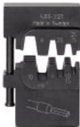
Die, for Crimpfox-M, for ferrules 0.25 - 10 mm 2 , packed in a serial storage box

Please be informed that the data shown in this PDF Document is generated from our Online Catalog. Please find the complete data in the user's documentation. Our General Terms of Use for Downloads are valid ( http://phoenixcontact.com/download )