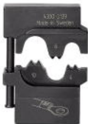
Die, for Crimpfox-M, for non-insulated cable lugs 4 - 10 mm 2 , packed in a serial storage box

Please be informed that the data shown in this PDF Document is generated from our Online Catalog. Please find the complete data in the user's documentation. Our General Terms of Use for Downloads are valid ( http://phoenixcontact.com/download )