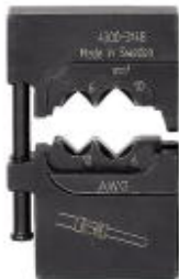
Die, for Crimpfox-M, for turned contacts 6 - 10 mm 2 , packed in a serial storage box

Please be informed that the data shown in this PDF Document is generated from our Online Catalog. Please find the complete data in the user's documentation. Our General Terms of Use for Downloads are valid ( http://phoenixcontact.com/download )