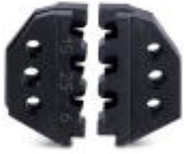
Spare die for CRIMPFOX-SC 6

Replacement die - CRIMPFOX-SC 6/DIE - 1212051