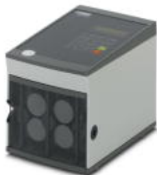
Automatic cutting device for cables, litz wires, and shrink sleeves, for 100 - 240 V mains voltage

Please be informed that the data shown in this PDF Document is generated from our Online Catalog. Please find the complete data in the user's documentation. Our General Terms of Use for Downloads are valid ( http://phoenixcontact.com/download )