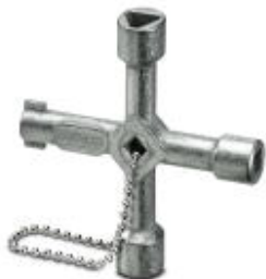
Control cabinet key, metal, for all common types of control cabinet

Please be informed that the data shown in this PDF Document is generated from our Online Catalog. Please find the complete data in the user's documentation. Our General Terms of Use for Downloads are valid ( http://phoenixcontact.com/download )