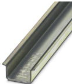
DIN rail, material: Steel, unperforated, height 15 mm, width 35 mm, length: 2 m

Please be informed that the data shown in this PDF Document is generated from our Online Catalog. Please find the complete data in the user's documentation. Our General Terms of Use for Downloads are valid ( http://phoenixcontact.com/download )