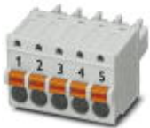
PCB connector, nominal current: 8 A, rated voltage (III/2): 160 V, nominal cross section: 1.5 mm 2 , number of positions: 5, pitch: 3.81 mm, connection method: Push-in spring connection, color: light gray, contact surface: Tin

Printed-circuit board connector - FK-MCP 1,5/ 5-ST-3,81GY35BD1-5 - 1015782