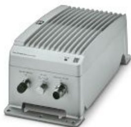
TRIO POWER primary-switched power supply in IP67 die-cast housing, input: 1-phase, output: 24 V DC / 20 A

Please be informed that the data shown in this PDF Document is generated from our Online Catalog. Please find the complete data in the user's documentation. Our General Terms of Use for Downloads are valid ( http://phoenixcontact.com/download )