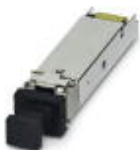
The small form-factor plug-in module provides a fiber optic interface with a data transmission speed of 100 Mbps with a wavelength of 1310 nm (long).