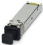
The small form-factor plug-in module provides a fiber optic interface with a data transmission speed of 100 Mbps with a wavelength of 1310 nm (long).